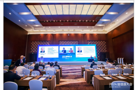
Brain health session, Beijing, Keynote 2024 lecture