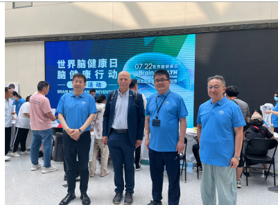
On the WBD, free consultations in neurology were offered to the public in the Tiantan hospital